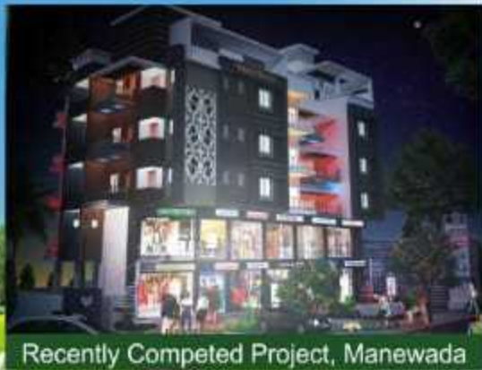
Recently Completed Project, Manewada